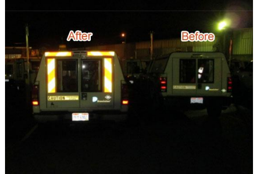
Retro reflective striping