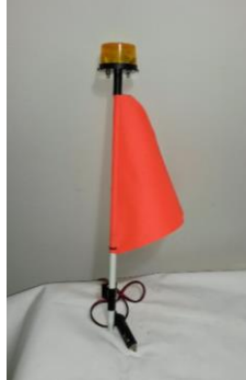
Buggy whip with flashing lights